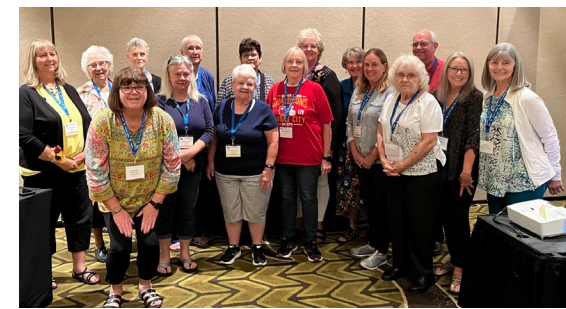
Above: Region 10 was the 2022 MRTA Diamond Region and had a great turnout at the Annual Meeting.