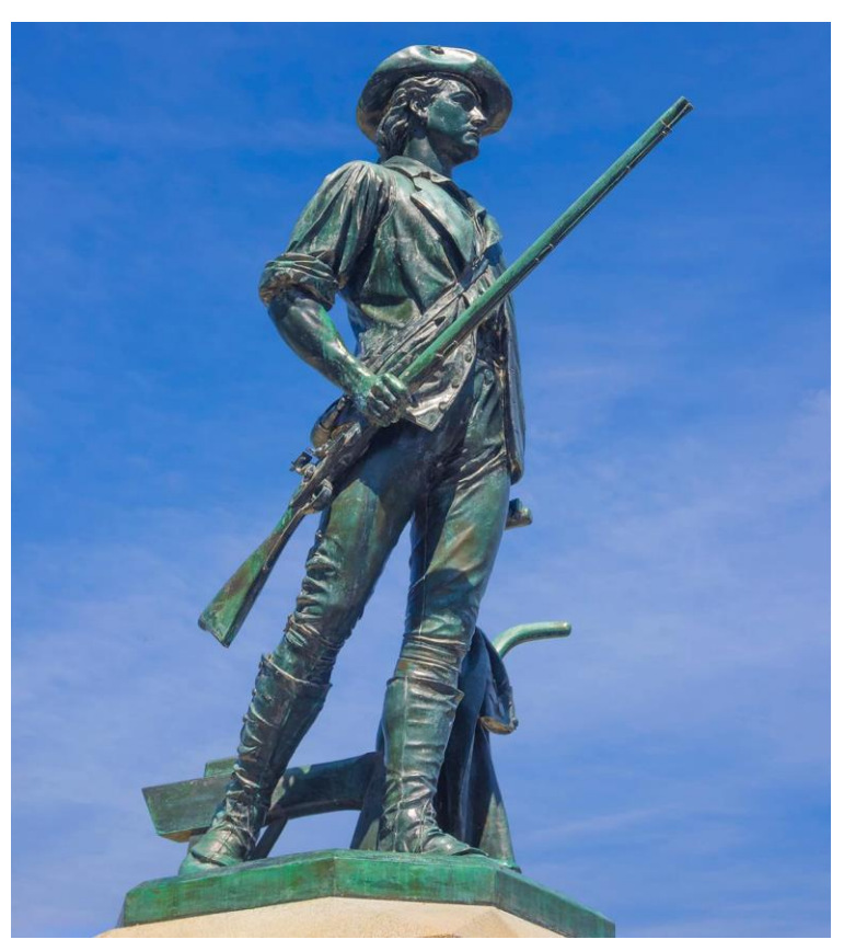
9 Days • 12 Meals: 8 Breakfasts, 1 Lunch, 3 Dinners

HIGHLIGHTS... Museum of the American Revolution, West Point Academy, NYC Panoramic Tour, Arlington National Cemetery, U.S. Capitol Building Tour, Lexington & Concord, Liberty Bell