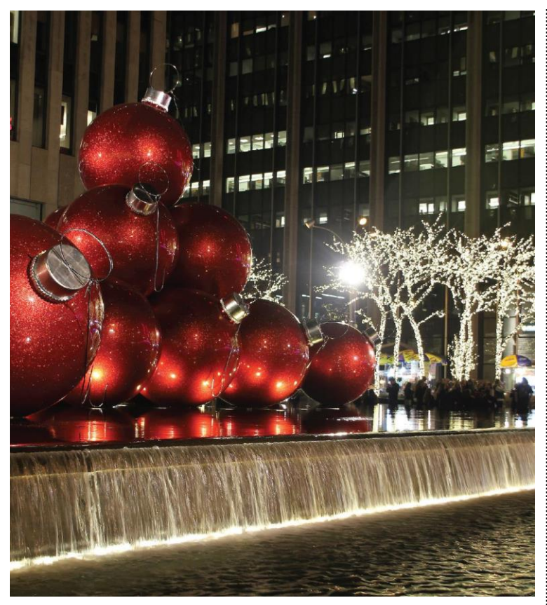
5 Days • 5 Meals : 3 Breakfasts, 2 Dinners

HIGHLIGHTS... Greenwich Village, Wall Street, Christmas Spectacular at Radio City Music Hall, Statue of Liberty, Ellis Island, 9/11 Memorial, 9/11 Museum, Broadway Show