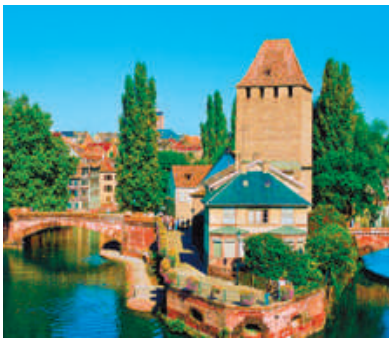
Germany - 6.8.15 to 6.19.15 Save $200 by Oct. 28, 2014