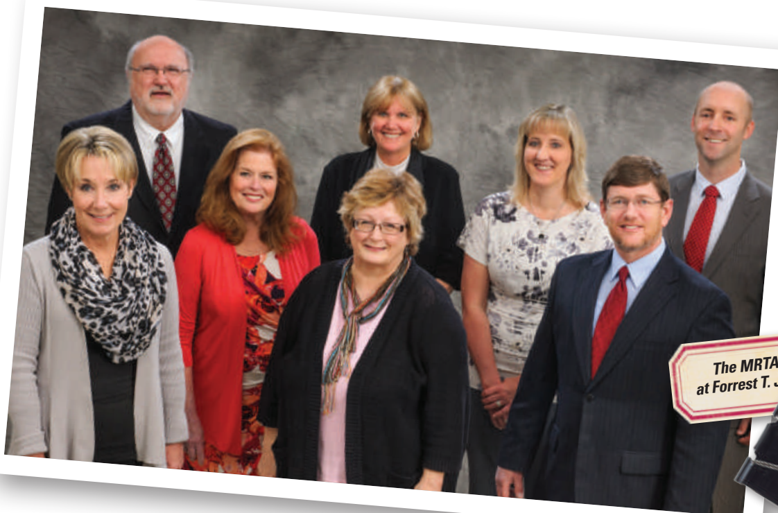
The MRTA Service Team at Forrest T. Jones & Company

An affordable solution that gives you the flexibility in utilizing the type of care that's right for you... in the comfort of your own home. These benefits are paid in addition to Medicare and other insurance. Optional benefits include: Annual Physical Exam, Vision, Hearing, Ambulance and In-Hospital Private Duty Nurse. For more information, call (800) 821-7303 ext. 1134.