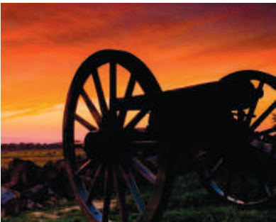
America's Historic East Save 10%. Ask me how!