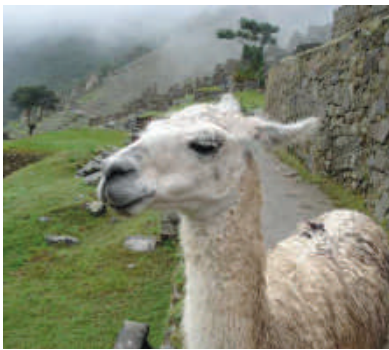
Peru - 7.19.15 to 7.31.15 Save $300 on air by Oct. 28, 2014