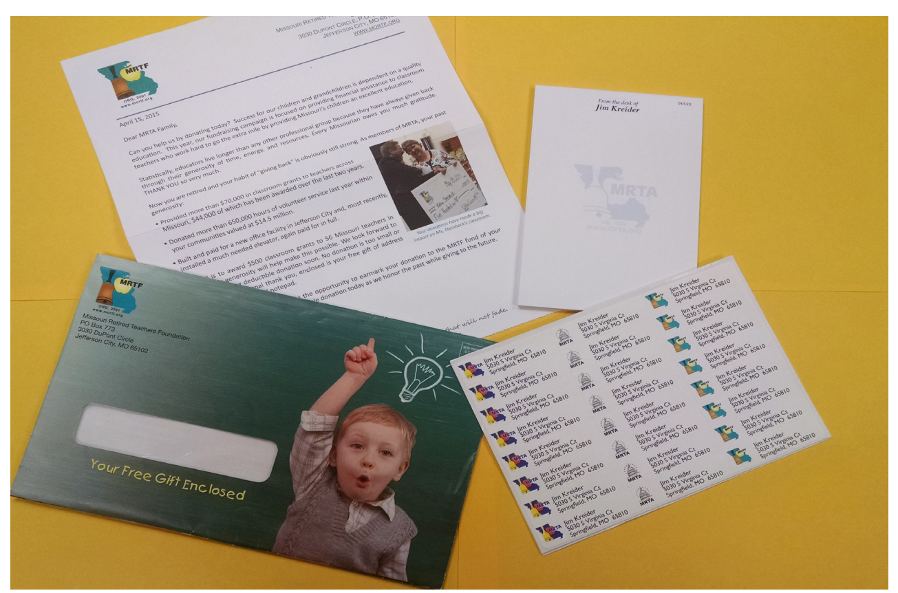
Please consider making a tax deductible donation to the Missouri Retired Teachers Foundation today! You may donate online at www.MORTF.org!